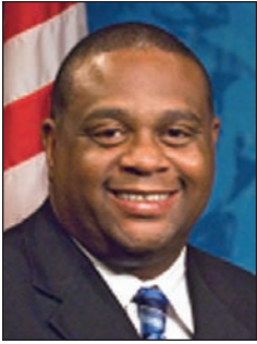
State Representative 24th Legislative District