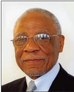
Dr. W. Wilson Goode, Sr.

Reverend Dr. W. Wilson Goode, Sr., President, AMACHI, Inc.