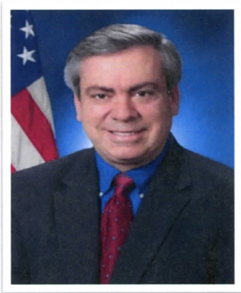
The Honorable Patrick M. Browne State Senator 16 th District