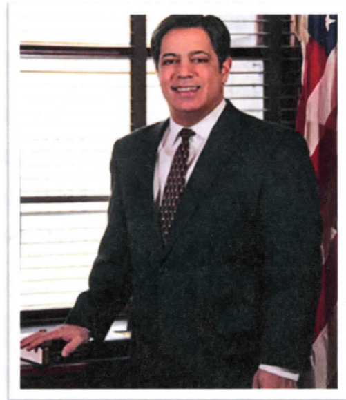
The Honorable Jay Costa, Jr. State Senator 43 rd District